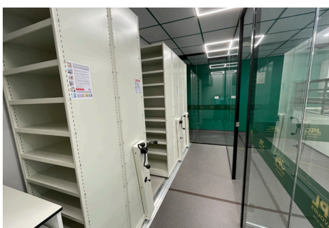
Roller racking for ingredient storage & glass partition