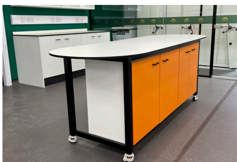
Mobile cabinet for tastings, storage & workspace