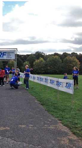
Some of Klick's staff in action installing labs and taking part in a Juvenile Diabetes Research Foundation fun run