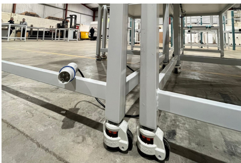
Commando socket & robust lockable castors