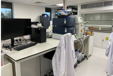
Sutura's laboratory facility with mobile benches