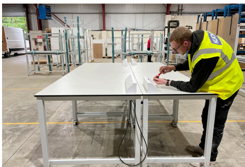
Connecting the electrics for the lab workstations