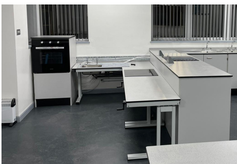
DDA workstation with height adjustable units

The school wanted to create a contemporary facility to inspire students to get involved with food technology.