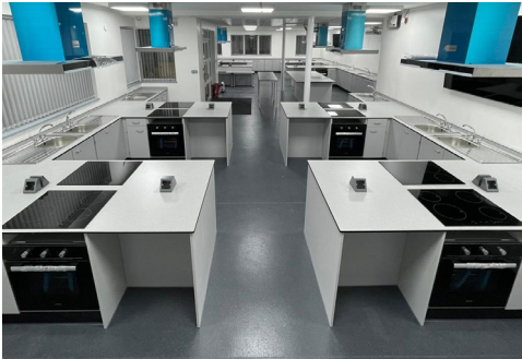
Food technology classroom with central walkway