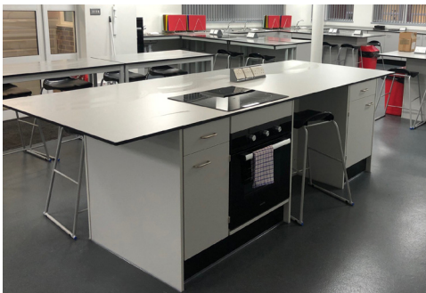
Teacher's demo bench with Trespa worktop