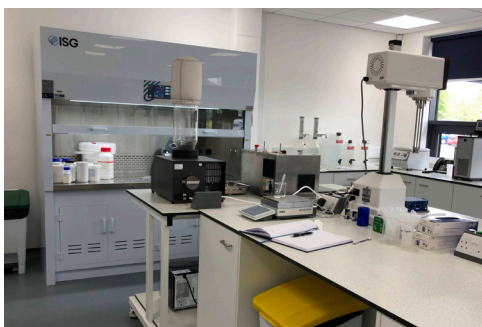
Recirculating fume cupboard with steel liner

CONTACT US NOW FOR A FREE NO OBLIGATION QUOTE