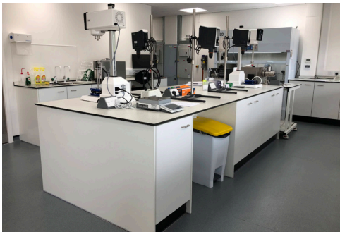
Island bench with Trespa work top

Acadian Seaplants Limited is a producer of seaweed, marine plant-derived products and natural plant/crop biostimulants. They were setting up their first UK laboratory facility at the Malvern Hills Science Park. The brief was to design and install flexible and high quality furniture suitable for laboratory use.