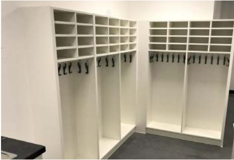
Fitted furniture for clean room

The Klick design team worked on a bespoke furniture design for the storage of lab shoes, gowns and coats. The furniture design was to be suitable for a sterile clean room environment and have no visible fixings.