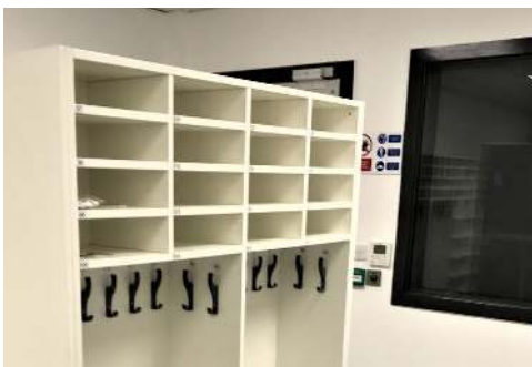
Numbered hooks and clean gown storage

CONTACT US NOW FOR A FREE NO OBLIGATION QUOTE