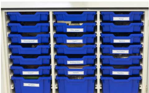
Labelled tray storage

CONTACT US NOW FOR A FREE NO OBLIGATION QUOTE