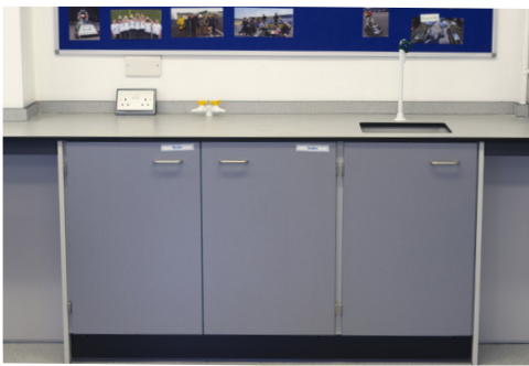
Perimeter benching with services

Klick also installed large cupboards and ample tray storage so that all equipment is organised and easily accessible. The labelling of trays allows for easy identification and facilitates the smooth running of lessons. The staff are delighted with the new design and improved functionality.