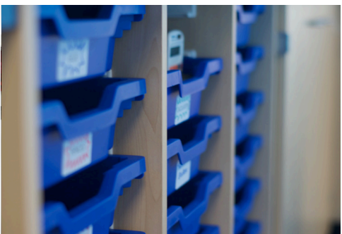
Gratnells tray storage