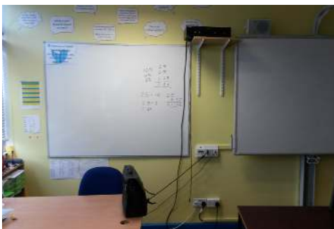
Maths classroom before refurbishment