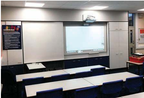
Maths classroom with new teaching wall